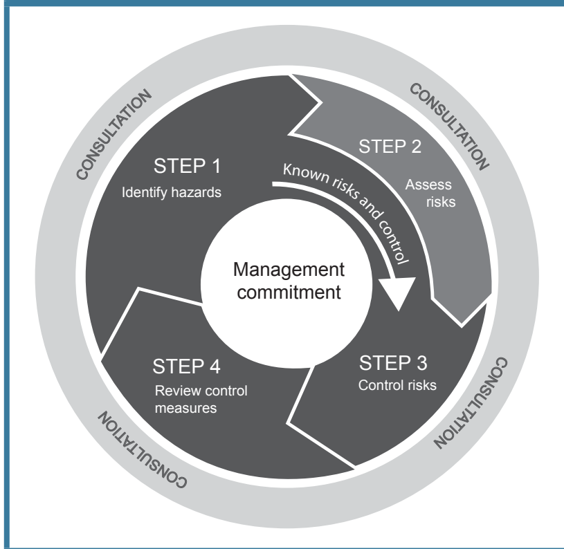
FIGURE 1: The risk management process

Many hazards and their associated risks are well known and have well established and accepted control measures. In these situations, the second step to formally assess the risk is unnecessary. If, after identifying a hazard, you already know the risk and how to control it effectively, you may simply implement the controls.