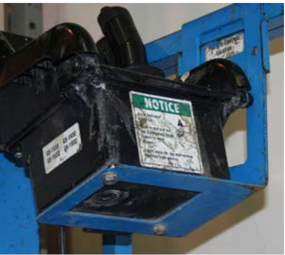
Damaged or deteriorated labels, like the one above, need to be replaced.

The appendix provides a typical inspection guide that can help you to conduct a thorough inspection of your facility. It will help you to identify and note safety hazards and identify problems that can be eliminated through proper labeling and signage. Appendix A is based on the Graphic Products Facility Safety & Identification Workbook.