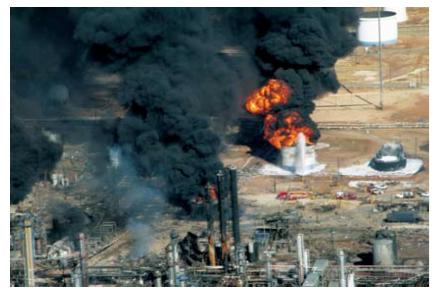
An explosion at an oil refinery in Big Springs, Texas caused a major fire. The event injured 5 and shut down the facility for two months.

While the 2007 figures are still too high, this number "represents the smallest annual preliminary total since the Census of Fatal Occupational Injuries (CFOI) program was first conducted in 1992."<sup>1</sup>