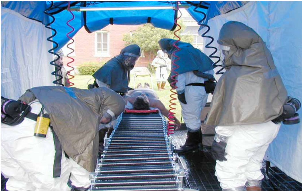
A roller system platform helps move non-ambulatory victims on backboards through the decontamination facility.