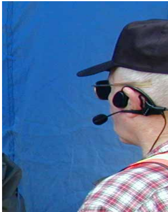
Detail of “temple-transducer” style radio headset.