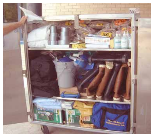
Staff can quickly move wheeled equipment carts from storage to the staging area.

Protective equipment storage can present challenges. The hospitals that were interviewed typically use one of two methods: cabinets or plastic storage boxes on shelves. Hospital A uses large stainless steel rolling cabinets that can be pushed to the ED entrance for easy equipment access when the decontamination facility is activated. Other hospitals use clear (easy to see contents) or colored (for coding) plastic storage containers to hold PPE sets and other supplies. To ensure equipment is convenient during an emergency, the hospitals store equipment on shelves or