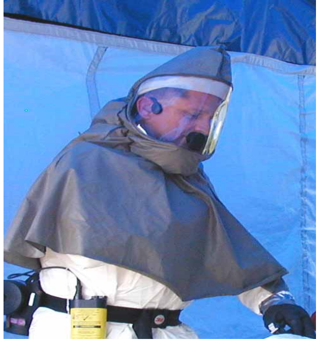
“Temple-transducer” style two-way radio headset stays in place under PAPER hoods.