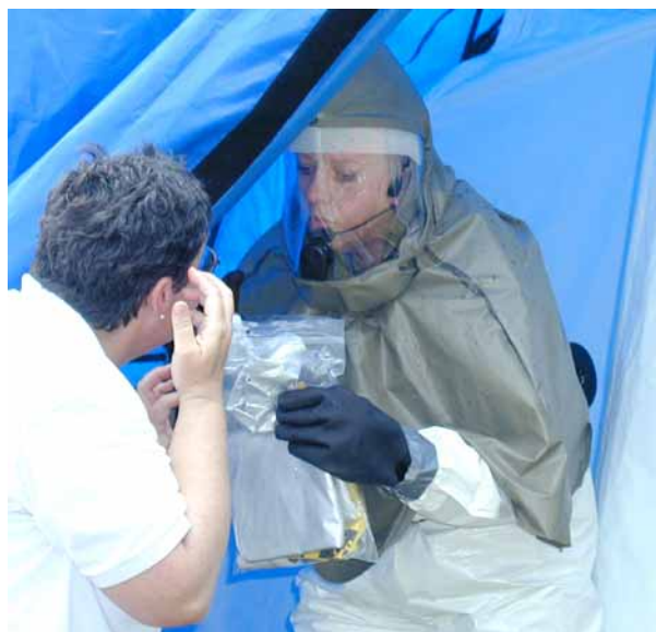
Put victim's personal items in a labeled plastic zip bag.

All of the steps above can influence the extent of healthcare workers' exposure to the contaminant. However, certain steps should be highlighted for their direct impact on the concentrations of contaminant first receivers will encounter. For example, disrobing might remove as much as 75 to 90 percent of the contaminant arriving on a victim (Macintyre et al., 2000; USACHPPM, 2003a). 67 By isolating (double-bagging) the contaminated clothing, staff prevent these materials from off-gassing into the work area. To minimize first receiver exposure levels, these steps should be implemented immediately as victims arrive.