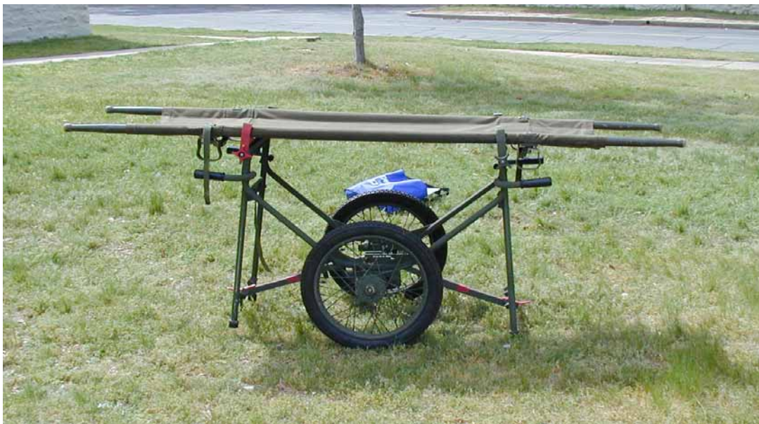
Hospitals can obtain military surplus equipment to supplement the decontamination facility supplies. (Shown here: a field stretcher for transferring non-ambulatory victims from arriving vehicles to the decontamination facility.)