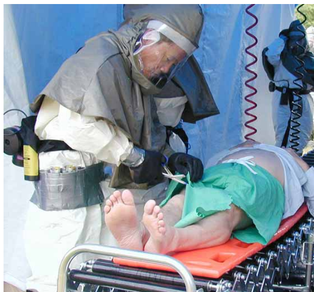
Use blunt scissors to cut away clothing. Avoid stretching or wringing cloth.

First receivers are likely to experience the greatest exposures while assisting non-ambulatory victims. Staff should take steps to identify possible sources of contamination and limit their exposure to those sources. For example, Hospital A uses specific procedures for removing victims clothing to minimize first receiver and victim exposures. Assistants use blunt-nose scissors to cut away clothing, rather than pulling it off. Tugging on clothing can produce a wringing action that might distribute contaminant on the victim, healthcare workers, and the surrounding area. Once removed, the clothing is immediately placed into a sealed container.