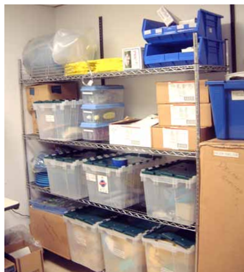
A storage room near the ED door offers convenient access for first receivers' supplies.